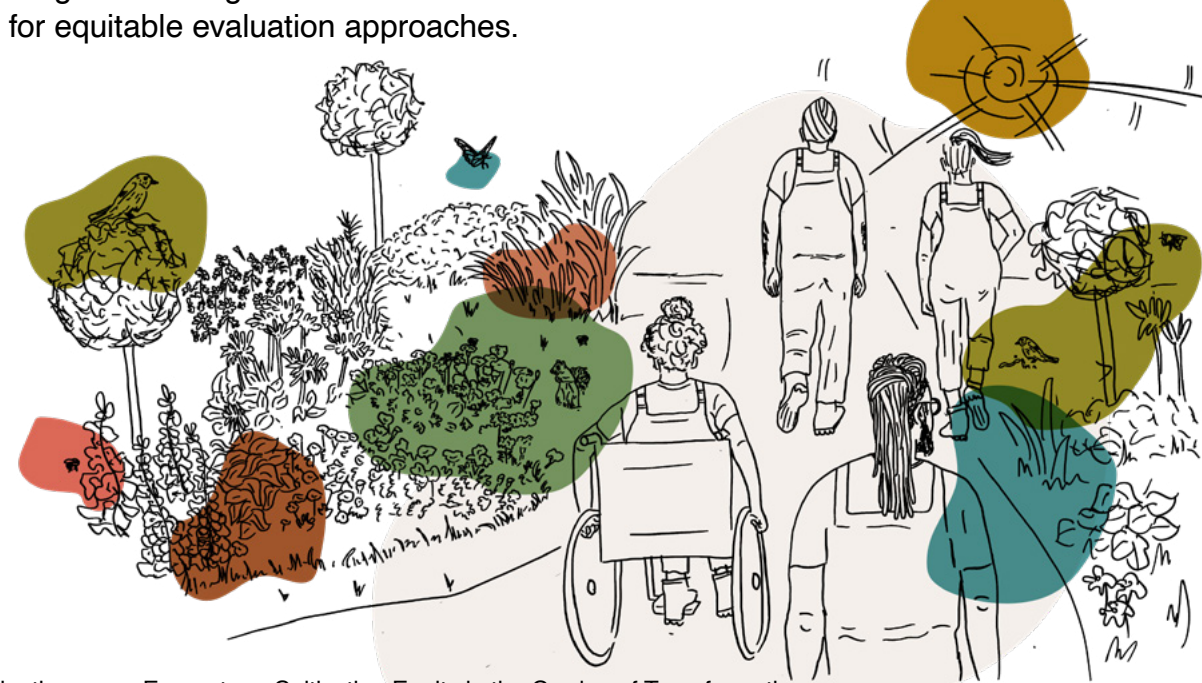
Evaluation as an Ecosystem: Cultivating Equity in the Garden of Transformation

With every step and seed planted, we move forward together towards a fairer, more fertile and enriching field of evaluation for all the communities involved.